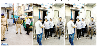
વિદ્યાર્થીઓ દ્વારા આયોજન કરાયેલું છે.

જામનગર શહેર ના નામક પોલીસ સ્ટેશન પર યોજાયેલું છે. આ મહોત્સવને આગળ કોલેજના વિદ્યાર્થીઓએ સ્વચ્છતા અને સંસ્કૃતિને પ્રમુખસ્થાને રાખીને આયોજન કરવામાં આવ્યું હતું. આ મહોત્સવને આગળ કોલેજના વિદ્યાર્થીઓએ સ્વચ્છતા અને સંસ્કૃતિને પ્રમુખસ્થાને રાખીને આયોજન કરવામાં આવ્યું હતું.